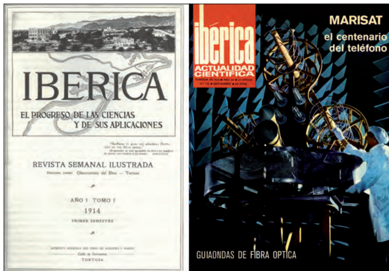
Fig. 3. Left, cover of the first issue of Ibérica (1914). Right, cover of one of the last issues of the journal (2005).