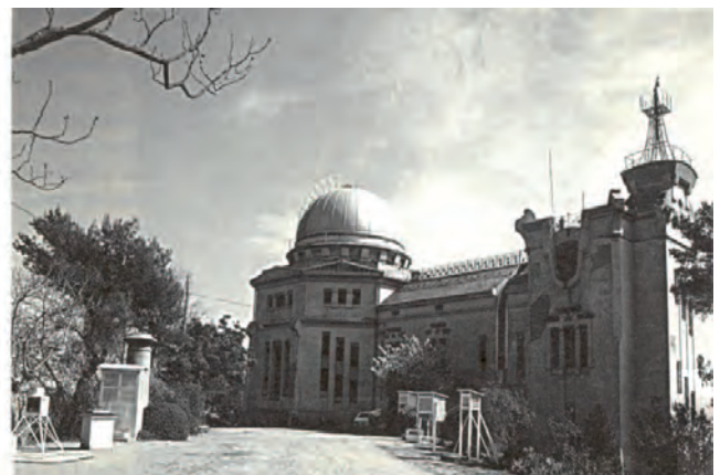
Fig. 2. Left, the Ebro Observatory (Roquetes). Right, the Fabra Observatory (Barcelona).